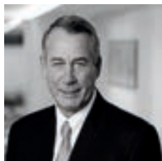
John Boehner Honorary Co-Chair Former Speaker of the U.S. House of Representatives