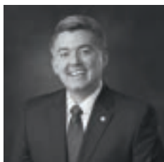
Cory Gardner Former U.S. Senator