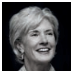
Kathleen Sebelius Honorary Co-Chair Former U.S. Secretary of Health and Human Services